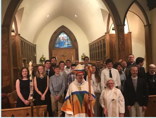
Those who were Confirmed, Received and Reaffirmed from Calvary and St. Lukes with their Bishop and Priests