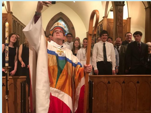
A Selfie with the Bishop!