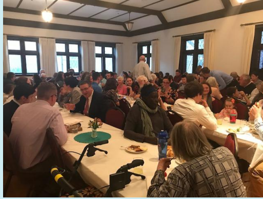
A lovely reception with great food and conversation